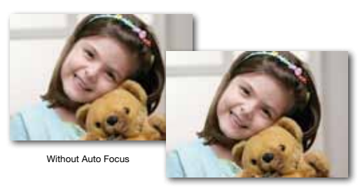
With Auto Focus

Beyond optical resolution, the CCD sensor sports a longer 6-line CCD sensor array with 5.5µm pixels that provides greater scanning details during every pass. The scanner is also equipped with an Auto Focus system for clearer and sharper scans. The optical system can achieve pinpoint focusing automatically, or allows you to take full creative control via optional Manual Focus.